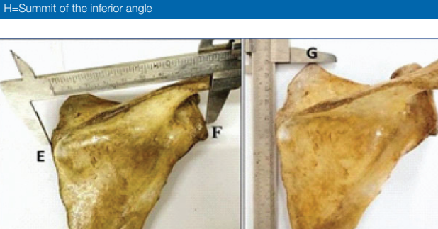
[Table/Fig-2]: Measuring Scapular Breadth (SB) and Scapular Length (SL) using Vernier caliper in right scapula in the present study.